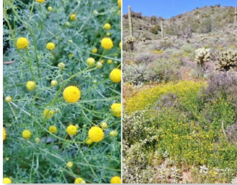
This sea of yellow shows where Oncosiphon piluliferum is spreading at Cave Creek Regional Park. Unfortunately, this is becoming a common site in central Arizona's open spaces, roadsides, and urban areas.