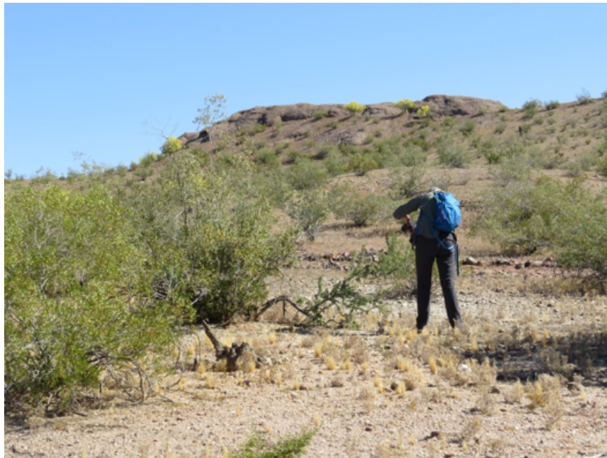
A BioBlitz participant taking photographs of wildlife in Tempe's Papago Park Preserve.

In addition, all of the observations from our BioBlitz are automatically added to an ongoing iNaturalist project within Tempe's Papago Park Preserve, which can be viewed at https://www.inaturalist.org/projects/wildlife-of-tempe-s-papago-park-preserve . If you are a periodic or regular visitor, we encourage you to add any past or future wildlife observations to iNaturalist. All observations pinpointed within the Preserve's boundary will automatically be added to this ongoing project. You can also select to "join/follow" this project if you'd like to be notified about observations and announcements pertaining to it.